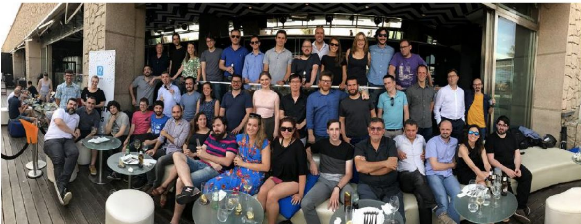
The Qustodio Team.

Subscribers, customers, employees, partners and collaborators for being part of our success.